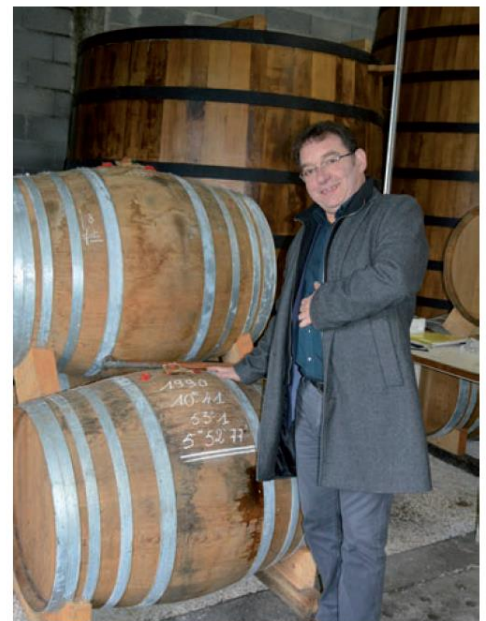
5 hl 52 of the 1990 vintage, equating to approximately 734 bouteilles of the precious nectar