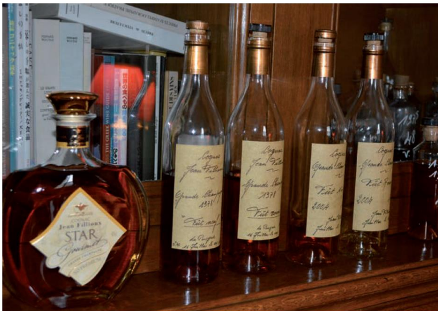
Jean Fillioux: Very racy, refined brandies with substantial ageing capacity